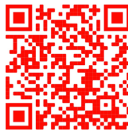
QR Code for YouTube Channel Sunday Worship