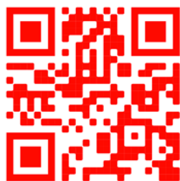
QR Code for Church bulletin, announcements

We would like to extend our warmest welcome to you who are attending our Worship Service today, particularly to those who are joining our fellowship for the first time. Newcomers are cordially requested to fill out a registration card located in the slots behind the pews