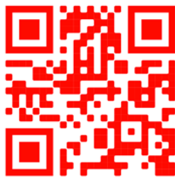
QR Code for Church bulletin, announcements