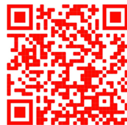
QR Code for YouTube Channel Sunday Worship