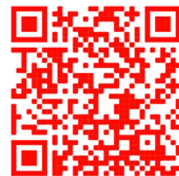
QR Code for YouTube Chanell Sunday Worship