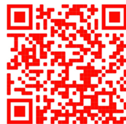
QR Code for YouTube Chanell Sunday Worship