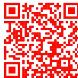
QR Code for YouTube Chanell Sunday Worship